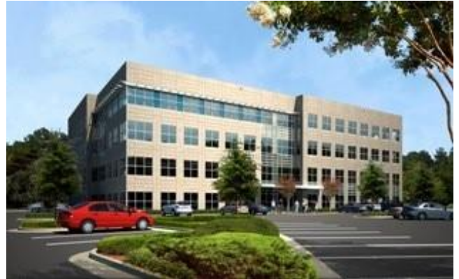
Faber Place- North Charleston