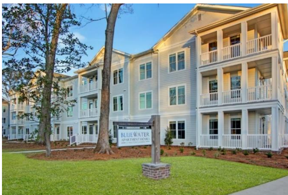
Bluewater Apartments at Bolton Landing

Phillip Simmons Middle School O'Quinn Bishop England- MTP 99 West Edge Apartments Downtown Agape Retirement Community Summerville