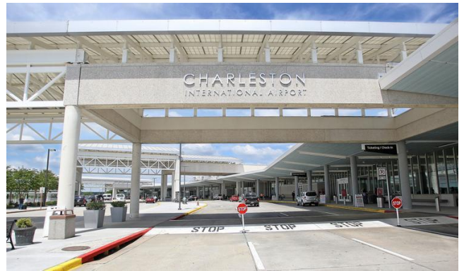
Charleston International Airport Renovation